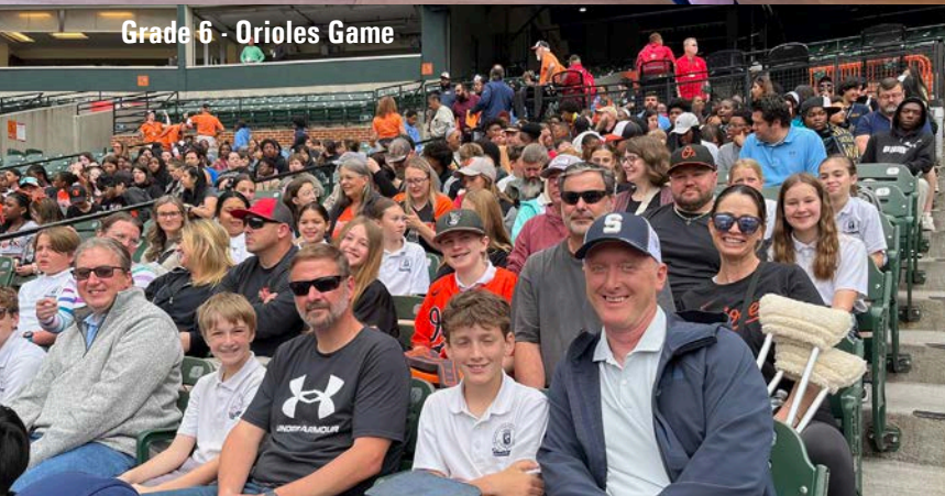
Grade 6 - Orioles Game