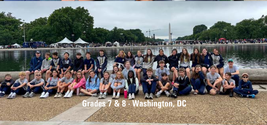
Grades 7 & 8 - Washington, DC