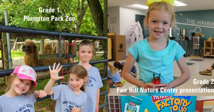
Grade 1 Plumpton Park Zoo