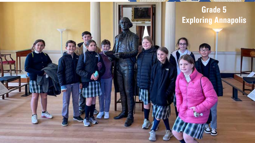
Grade 5 Exploring Annapolis