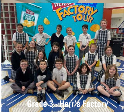
Grade 3 - Herr's Factory