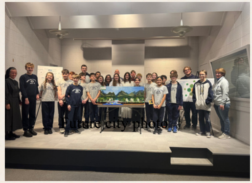
The Future City team and its mentors gather around its model during the regional competition.