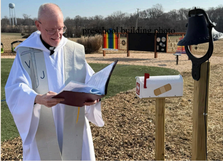
preschool building photo