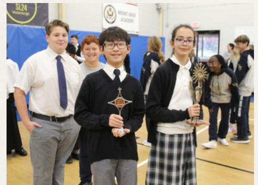
6 th Grade prepares for Mass

Every mass has parts that go in to create the lovely mass that we go to every month.